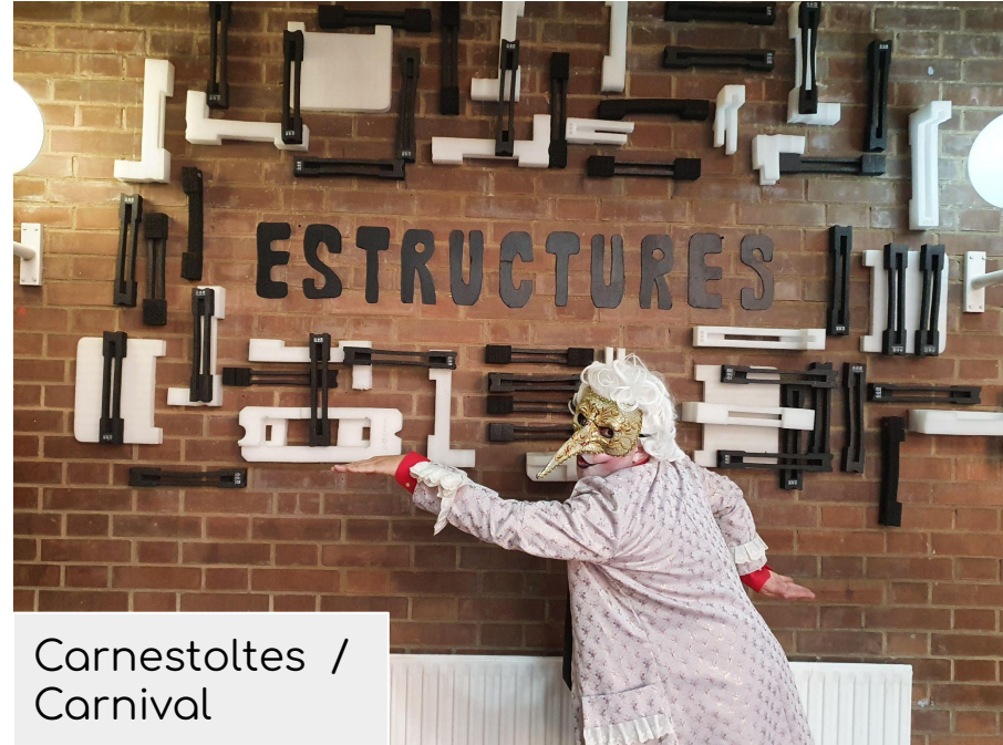
Carnestoltes / Carnival