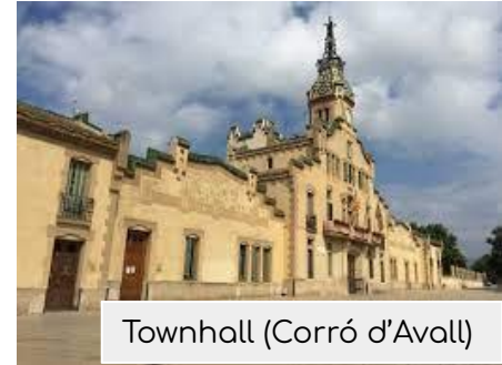
Townhall (Corró d'Avall)