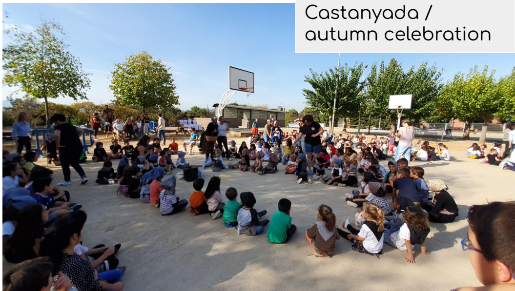
Castanyada / autumn celebration