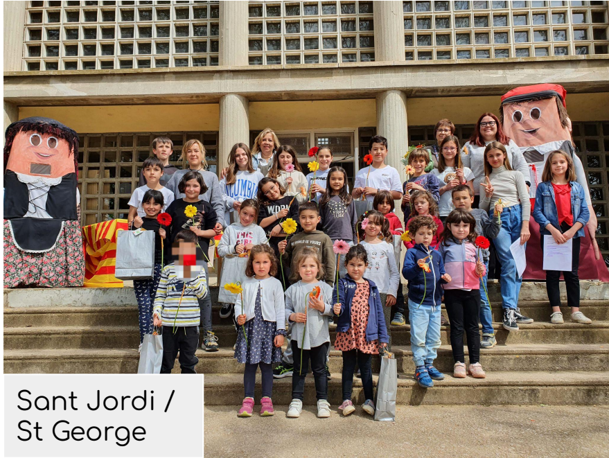
Sant Jordi / St George